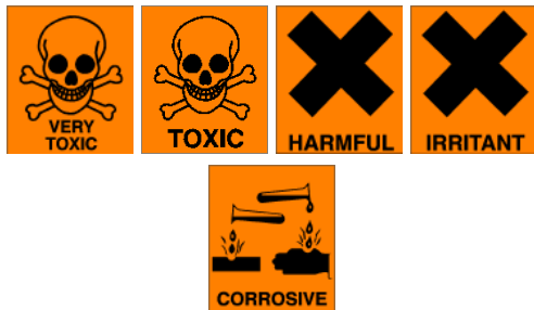
European system (pre-June 2015)